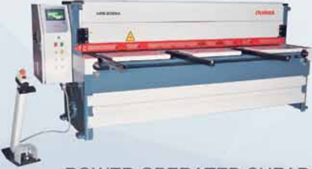
POWER OPERATED SHEAR