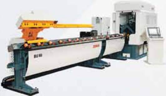
L ANGLE PROCESSING CENTER