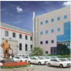
After Sales Service