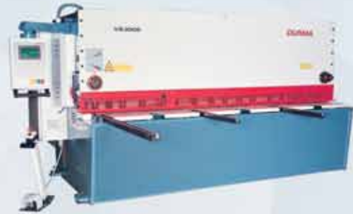
VARIABLE RAKE SHEAR