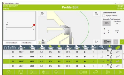
This function automatically calculates bending sequence, analyses possible collisions and provides information in graphic display for the operator.