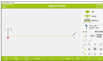
Draw your own profile and set the measurements, angles and values for radial bending.

ProLink W is Windows based and can be linked to your network. You can also upload programs using QR code readers. With the planning tool Production from nuIT you get the profiles dimensioned directly in your system and you can even upload most file formats and construct bending programs this way.